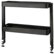
IKEA VATTENKAR Desktop Shelf, Black, 49x15 cm

I became aware of this via a sewing post on Facebook, and am going to buy at least one for my sewing machine table. But I think it would be good for machine knitting too. It comes in white also, and costs £15 - if you can't get to IKEA, delivery is £4, I think.